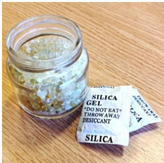
Introduction Page 3

The control will let you observe how an orange changes on its own over time.