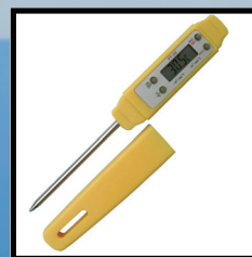
Digital Hot or Cold Food