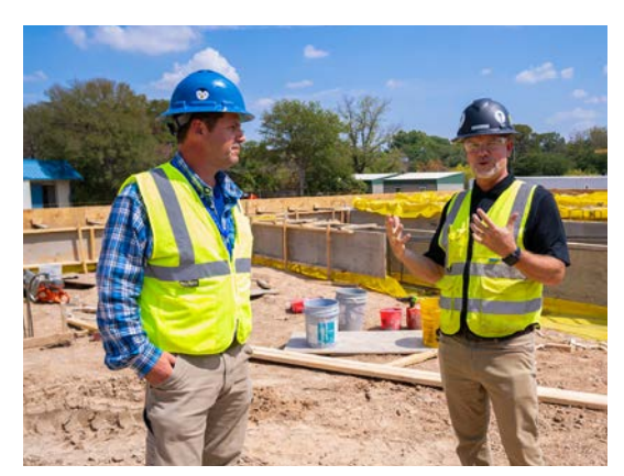
Facilities staff at the Penguin Shores construction site in August 2023.

The Municipal Court spearheaded a series of impactful community programs, including the City's first Homeless Court in coordination with the Salvation Army, the Youth Offender Prevention Program at local high schools, and the City's first amnesty program, which helped over 1,000 individuals resolve old debts and warrants. The court also created opportunities for defendants to resolve citations with community service, such as graffiti abatement clean-up projects.