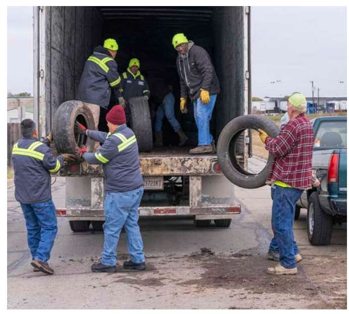
Solid Waste staff at the Scrap Tire Collection Day in November 2023.

Construction has begun on the new Municipal Solid Waste Landfill in addition to completing the design phase of the Transfer Station facility. Solid Waste Services also made fleet enhancements to support collection, landfill, and transfer station operations including the addition of five new collection trucks, a large compactor, a large bulldozer, a sweeper, a material handler, and two loaders.