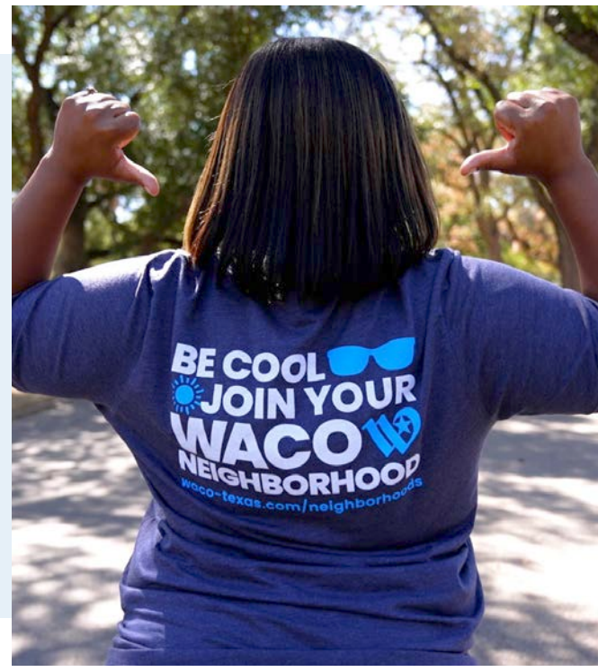
Waco neighbor showing off the "Join Your Neighborhood" t-shirt.

Whether you are new to Waco or a long-term resident, now is the time to join your neighborhood association.