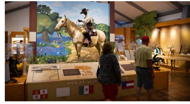
Texas Ranger Hall of Fame & Museum visitors at an exhibit.

The Texas Ranger Museum continues to receive national recognition as both a popular tourist destination and trusted research partner. In the last fiscal year, the museum assisted with 2,234 research