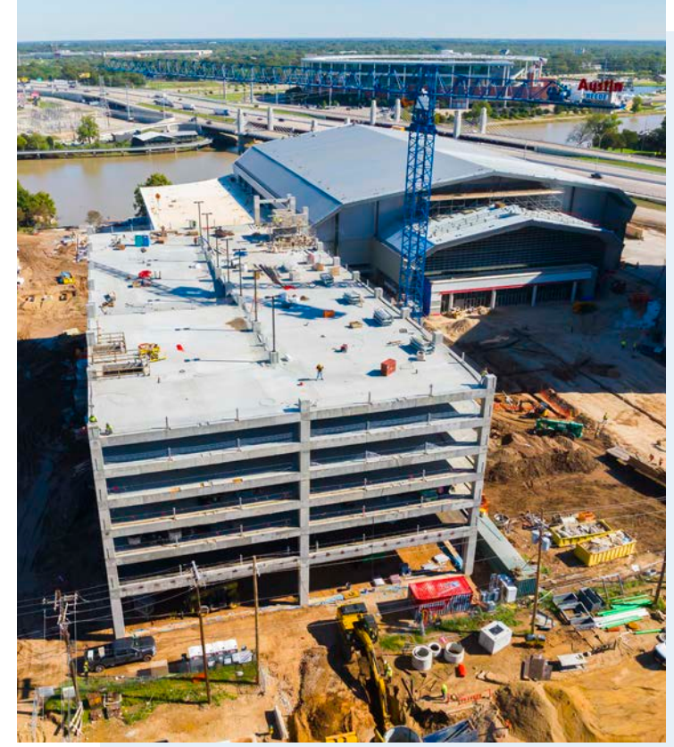
Foster Pavilion construction in October 2023.

The Economic Development Department created a comprehensive 10-year strategic plan featuring 127 action items that will lay the foundation for sustainable growth. A noteworthy accomplishment includes the successful recruitment of Terry Black's BBQ. Further, the expansion of Tax Increment Finance Zone 4 adds an additional 1,017 acres including collaboration from McLennan Community College and McLennan County. To streamline operations, the department implemented a new project management system to improve compliance and forecasting.