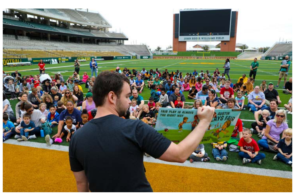
Library on the Go at McLane Stadium in March 2023.

Across four library branches, Waco-McLennan County Library presented over 800 programs for more than 20,000 patrons. One of the most impactful events from this past year was the unveiling of the Hispanic Wacoan Display featuring influential Wacoans both past and present.