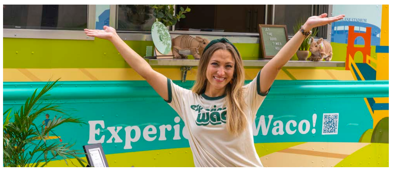
Waco Convention Center & Visitors Bureau staff unveil the mobile Welcome Center in May 2023.