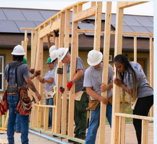
City of Waco staff volunteering at Habitat for Humanity's Raise the Roof program in October 2023.

Recognizing the importance of supporting our workforce during challenging times, the City of Waco introduced a catastrophic leave program and a critical incident initiative. In our commitment to language access, the City enhanced the bilingual pay program, rewarding employees proficient in languages based on business needs, beyond just Spanish. The City adopted a 30% repeating non-retroactive cost-of-living adjustment (COLA) and implemented a 5% general salary increase without increasing health insurance premiums.