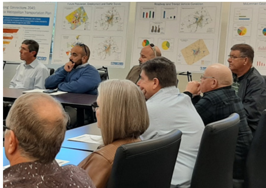
Public Informational Meeting held on January 6, 2020 to review a draft of Connections 2045: The Waco Metropolitan Transportation Plan.

The process to adopt Connections 2045: The Waco Metropolitan Transportation Plan, began in November, 2019 and concluded with adoption by the MPO Policy Board on January 17, 2020. Efforts to solicit citizen input on plan recommendations were conducted in accordance with the MPO Public Participation Plan and detailed in the following sections.