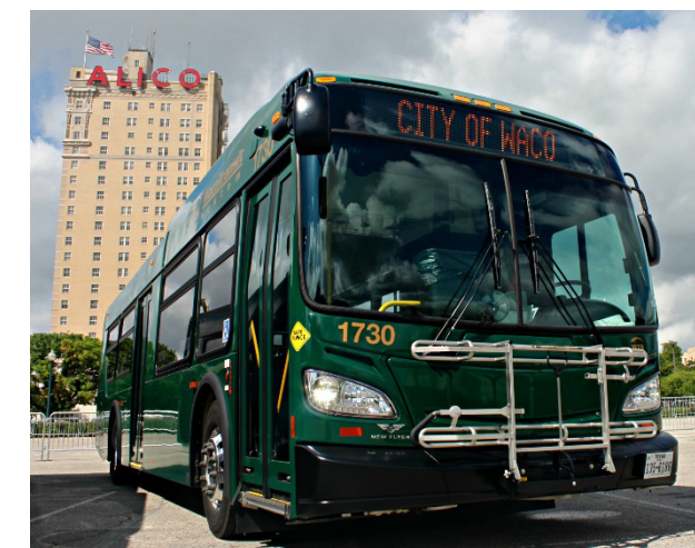
Waco Transit operates 16 of the low-floor ADA accessible transit buses (similar to the one pictured) within the Waco Urbanized Area.

Waco Transit System also offers two free-fare downtown area routes: The Silo District Trolley which circulates the Downtown Waco Area; and the La Salle Circle Shuttle, which connects the Downtown Waco Area to La Salle Avenue and the historic Waco Circle. The Silo District Trolley and La Salle Circle Shuttle generally run between 9:00 AM – 6:00 PM Monday through Saturday.