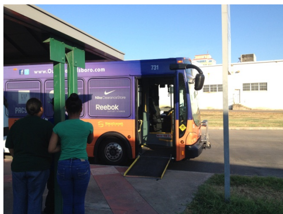
Each bus utilized for the urban fixed route system is compliant with the requirements for the Americans with Disabilities Act and is able to accommodate wheelchair access.

Demand response van service under the Americans with Disabilities Act (ADA) began in Waco in 1993. Demand response provides door-to-door service for those unable to use the fixed route service due to some type of ambulatory difficulty. Persons using this service must qualify based on several criteria as defined by the Federal Transit Administration (FTA). In addition, only persons residing within the designated ADA service area qualify to use the service (identified on Map 4.7). Current ridership on the van service is approximately 4,100 persons per month. Demand for this type of service is expected to continue to increase. The fare for the van service is $6 per round trip.