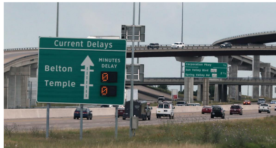
The Texas Department of Transportation has installed dynamic message signs along IH-35 to provide real time travel information to alert motorists and provide alternate route information. This sign is located along southbound IH-35 near the SH 6 / West Loop 340 interchange as motorists head towards the Temple / Belton area. A similar sign is found for northbound IH-35 just outside of Temple to provide delay information through the Waco area.

Of a more permanent status, TxDOT has installed cameras and dynamic message signs at several locations within the region as construction phases are completed. In addition to the message signs, TxDOT has also installed 2 signs to provide motorists comparative travel time information for IH-35 versus Loop 340 as an alternate route through Waco. In addition to these, TxDOT has also installed delay signs for northbound IH-35 just north of the Temple area to alert motorists heading to Waco. Outside of IH-35, there are a small number of traffic cameras installed by TxDOT to provide real time images for IH-35 alternate routes. Other than these facilities, there is currently no other ITS infrastructure within the Waco Region. Map 4.6 identifies the location of ITS infrastructure within the Waco Region.