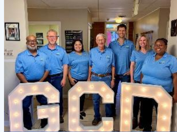
Grassroots Roof Repair