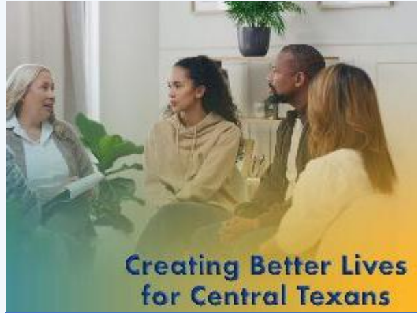
Behavioral Health Network