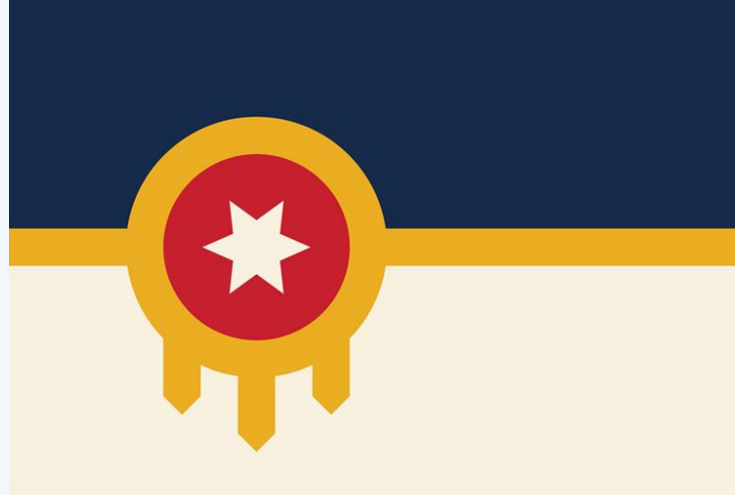
Tulsa's new flag