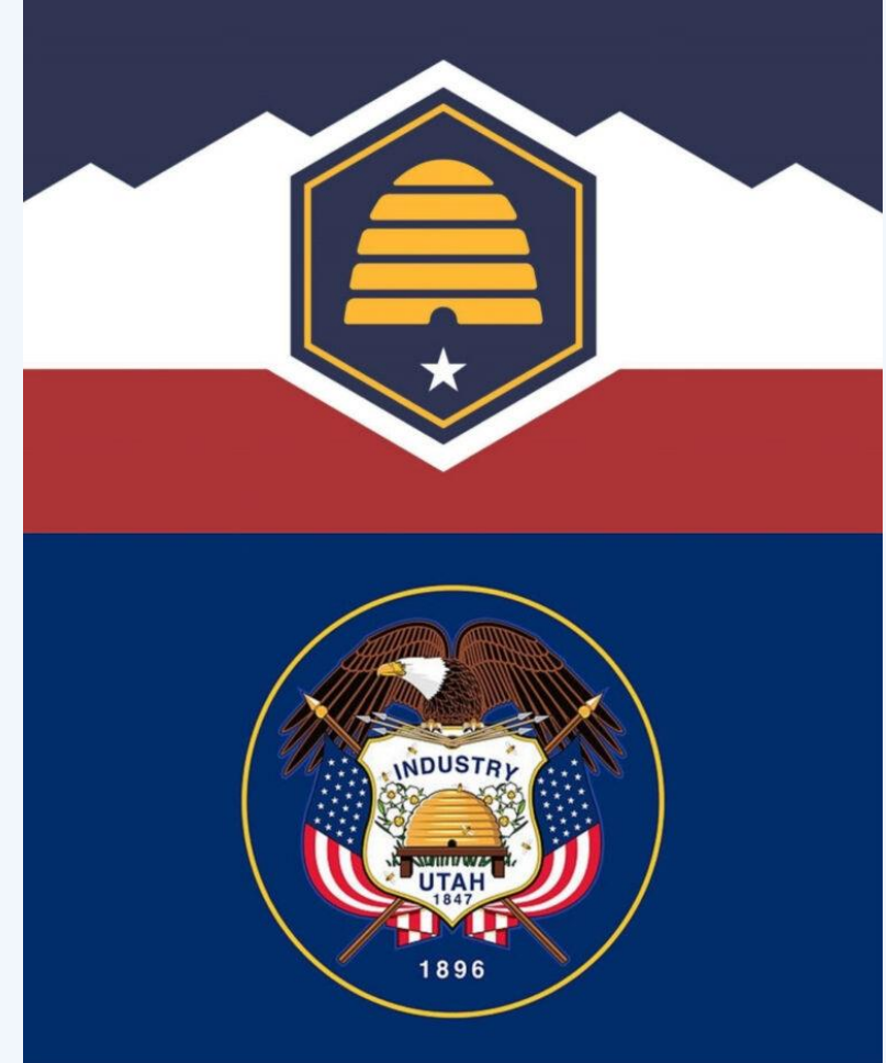
Utah's new flag