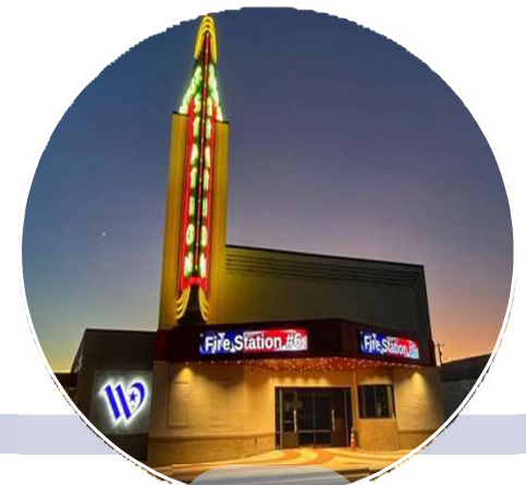
Fire Station #6