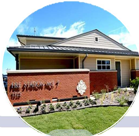
Fire Station #7