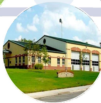
Fire Station #2