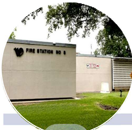
Fire Station #8