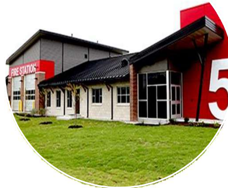
Fire Station #5