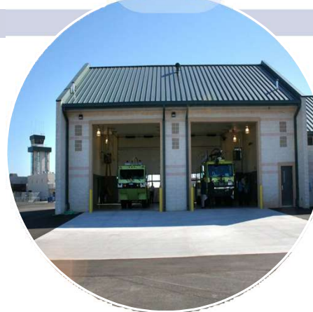
Fire Station #10