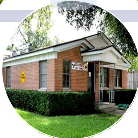
Fire Station #4