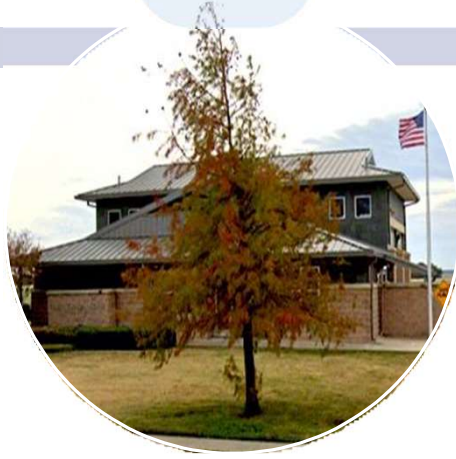
Fire Station #12