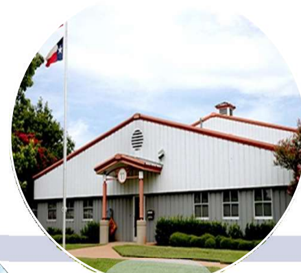
Fire Station #11