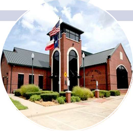
Fire Station #1