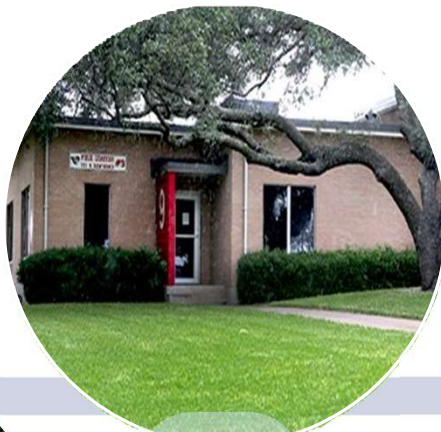
Fire Station #9