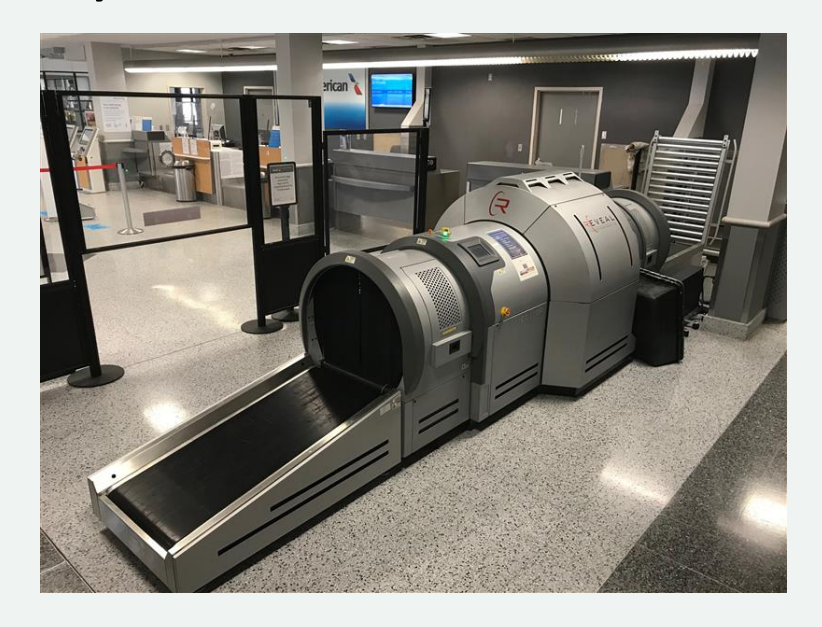
December 17, 2020