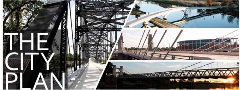
Waco Comprehensive Plan 2040