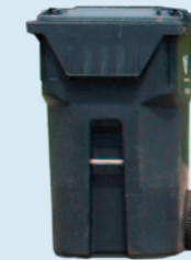
GARBAGE ONLY. Trash bags must be used to prevent litter and pests.