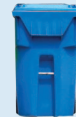
RECYCLABLES ONLY. Do not bag material.