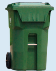
YARD WASTE ONLY. Do not bag material.